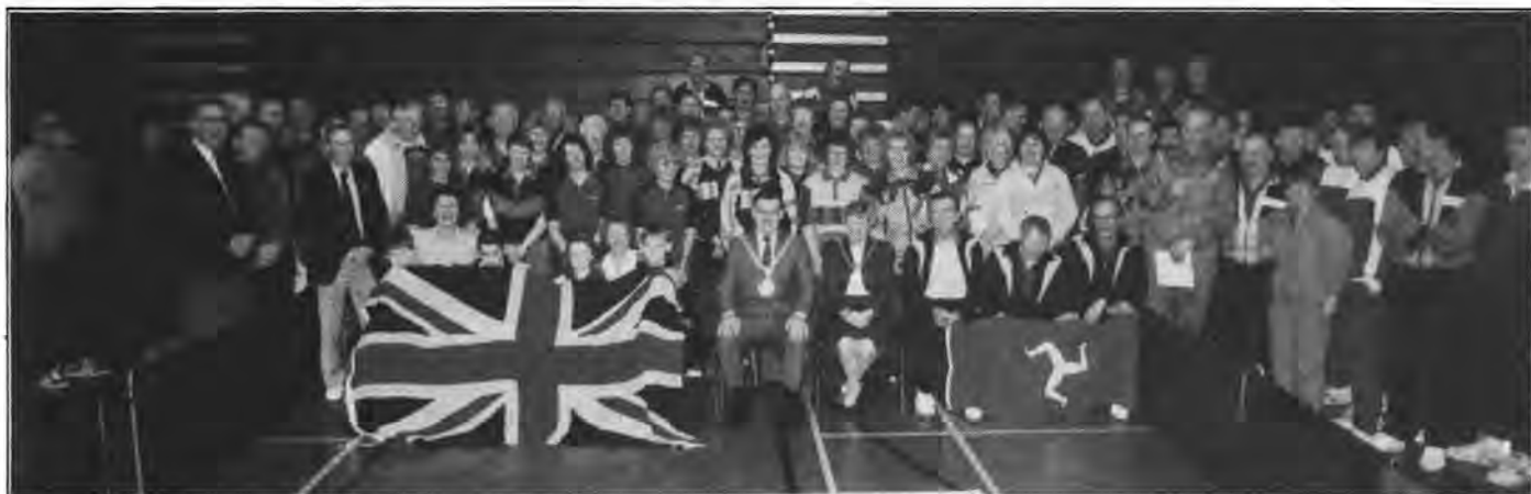
Players and officials before the inaugural start of the Veterans British League